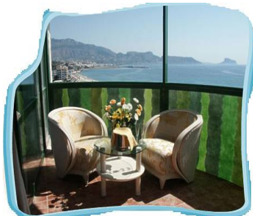
Coffee, breathtaking Mediterranean views, sunshine, sand, AA friends and Fellowship

The Morning English-Speaking Workshop begins on Saturday 3rd