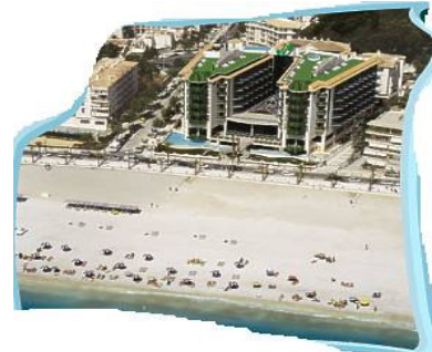
Seafront, 4* Hotel Kaktus faces the Albir beach

For those that wish to make a full weekend of it, on Friday and